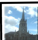
St. Andrews Church Bagenalstown

We encourage all to visit our newly revamped website. Parishioners, local organisations etc. and those from further afield are welcome to email any photos or info that they may wish to have on the site. Our website is very active and updated on a weekly basis email: bagenastownparish@eircom.net or you can email direct from the site. Visit the site and to pass on our address to relatives and friends abroad so they can keep up to date with local news